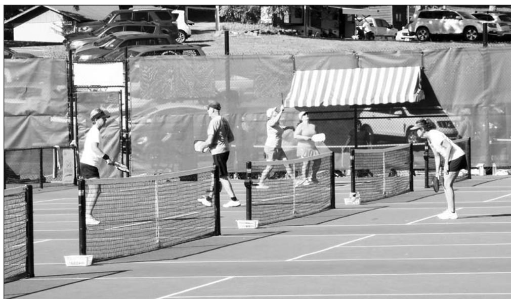
Pickleball has been wildly successful in Towns County and the surrounding area, thanks in large part to the passion of those who play it.

The American Legion is having a golf tournament on Thursday, October 12 at 10 a.m. Join fellow Veterans and supporters for a day of fun and golf at Chatuge Shores Golf Course. Cost is $55 per person. Call 404-295-6462 for more info. TOWNS COUNTY HERALD